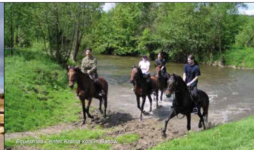
Equestrian Center Kraina koni in Bałtów