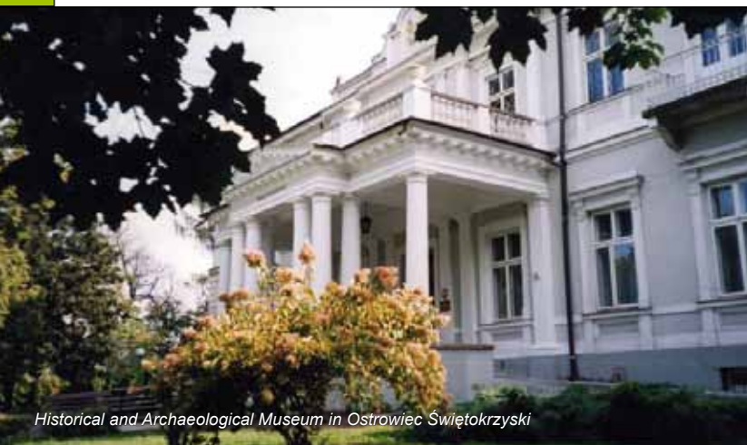
Historical and Archaeological Museum in Ostrowiec Świętokrzyski

BAŁTÓW, KRZEMIONKI OSTROWIEC ŚWIĘTOKRZYSKI, ĆMIELÓW