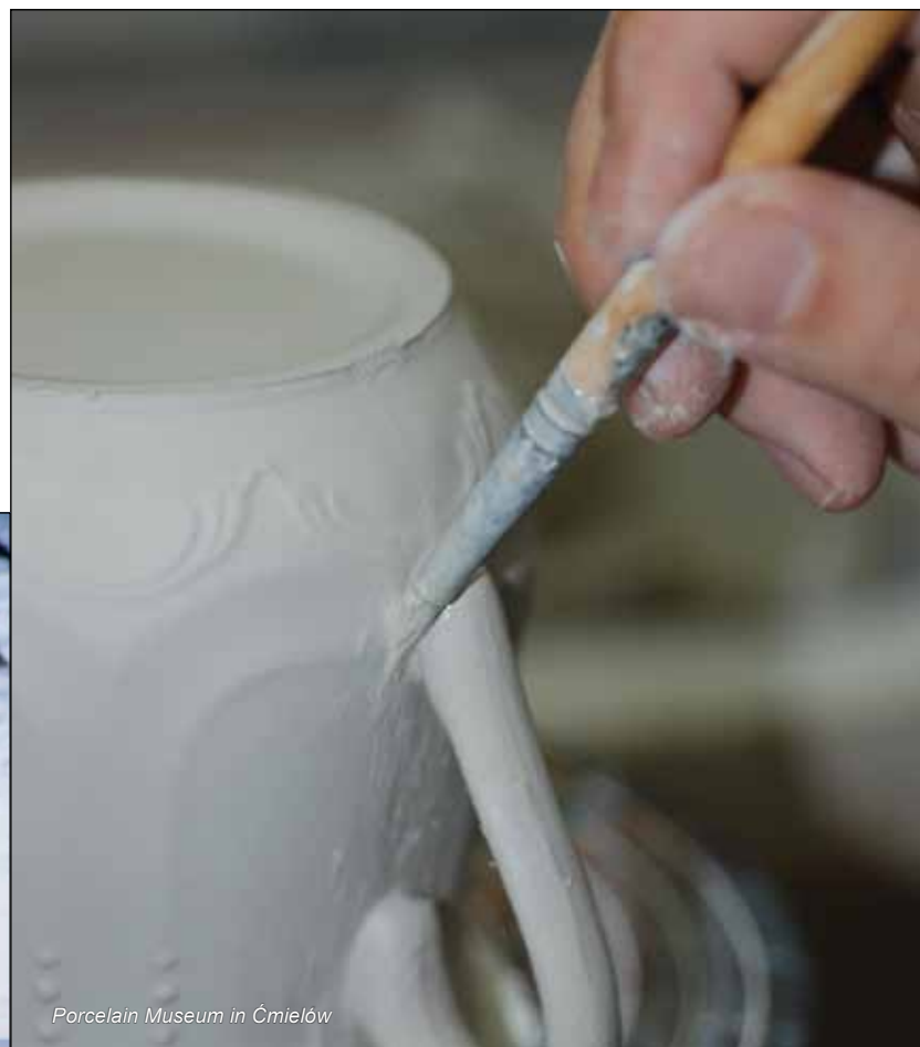
Porcelain Museum in Ćmielów

Ćmielów is famous for the production of the highest quality porcelain. The Porcelain Factory AS Ćmielów produces porcelain ware with the use of original models and moulds that survived together with the worldwide known traditions of the Ćmielów porcelain products. A logo of Ćmielów Exclusive is now found on the newest products of the Ćmielów factory: porcelain jewellery items. They are all hand-made and hand-decorated. The Live Museum of Porcelain was established on the factory premises in 2005. This unique institution not only displays the factory products, but also let visitors participate in the process of production as well as offer them a chance of making a finished items themselves.