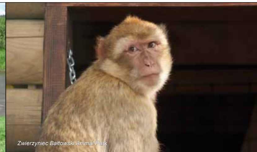
Zwierzyniec Bałtowski Animal Park